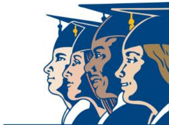
Recognizing Our Graduates

Deadline for submitting this information and the photo to the church office is noon Friday, June 1.